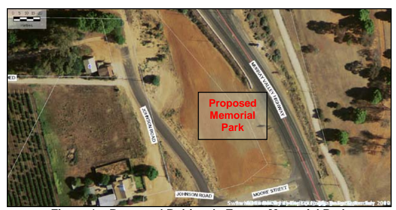
Figure 1 – Proposed Robinvale Euston Memorial Park

The REMPC have been working since 2007 on concept plans to develop a park on a vacant parcel of Council owned land located on the western side of the Bromley Road on the approach to the bridge across the Murray River. The objective of the park is to commemorate Australia's and Robinvale's military past. The land is bordered by Bromley Road to the east, Moore Street to the South and Johnson Street to the west. (See figure 1)