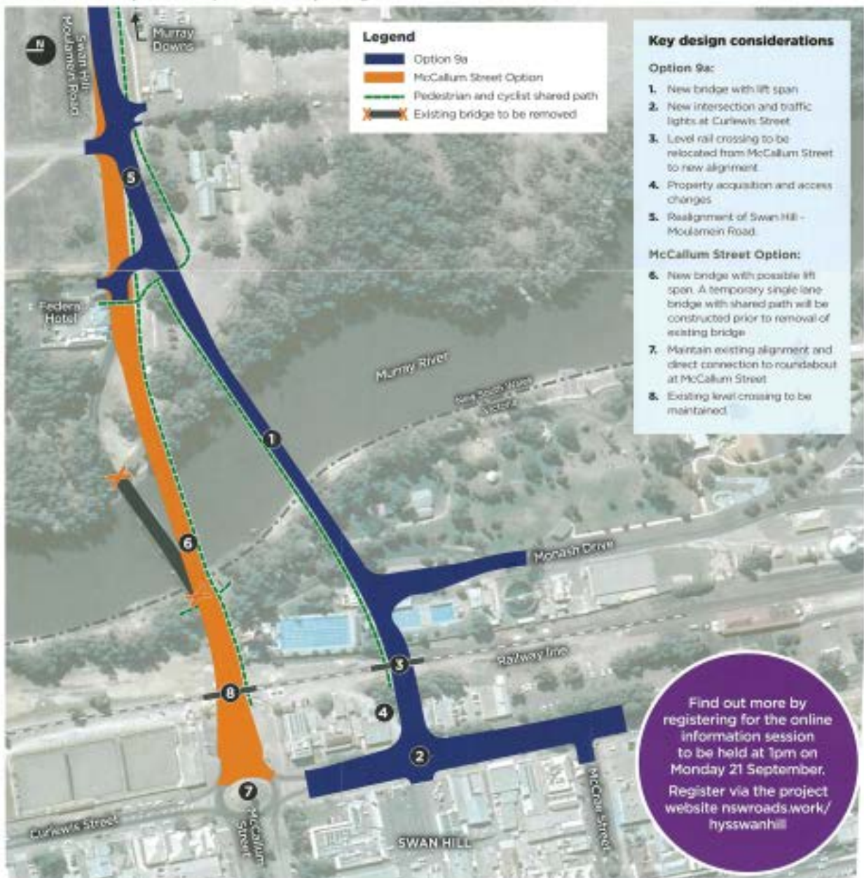
McCallum Street Option and Option 9a concept design

We will let you know when we are starting this process so you can have your say.